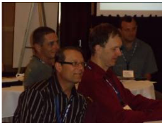
Conference participants listen attentively.